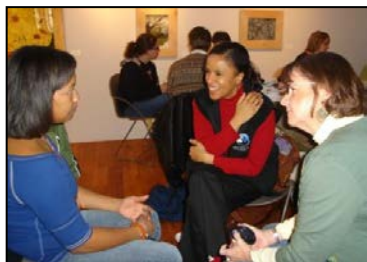
Class of 2008 Fellows